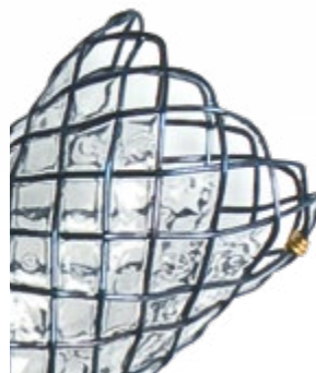
X-ray marking and covering