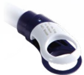
Introducer system for easy positioning